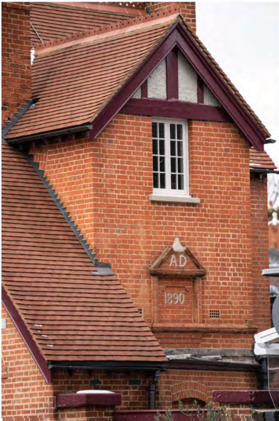
Grade listed 2 building