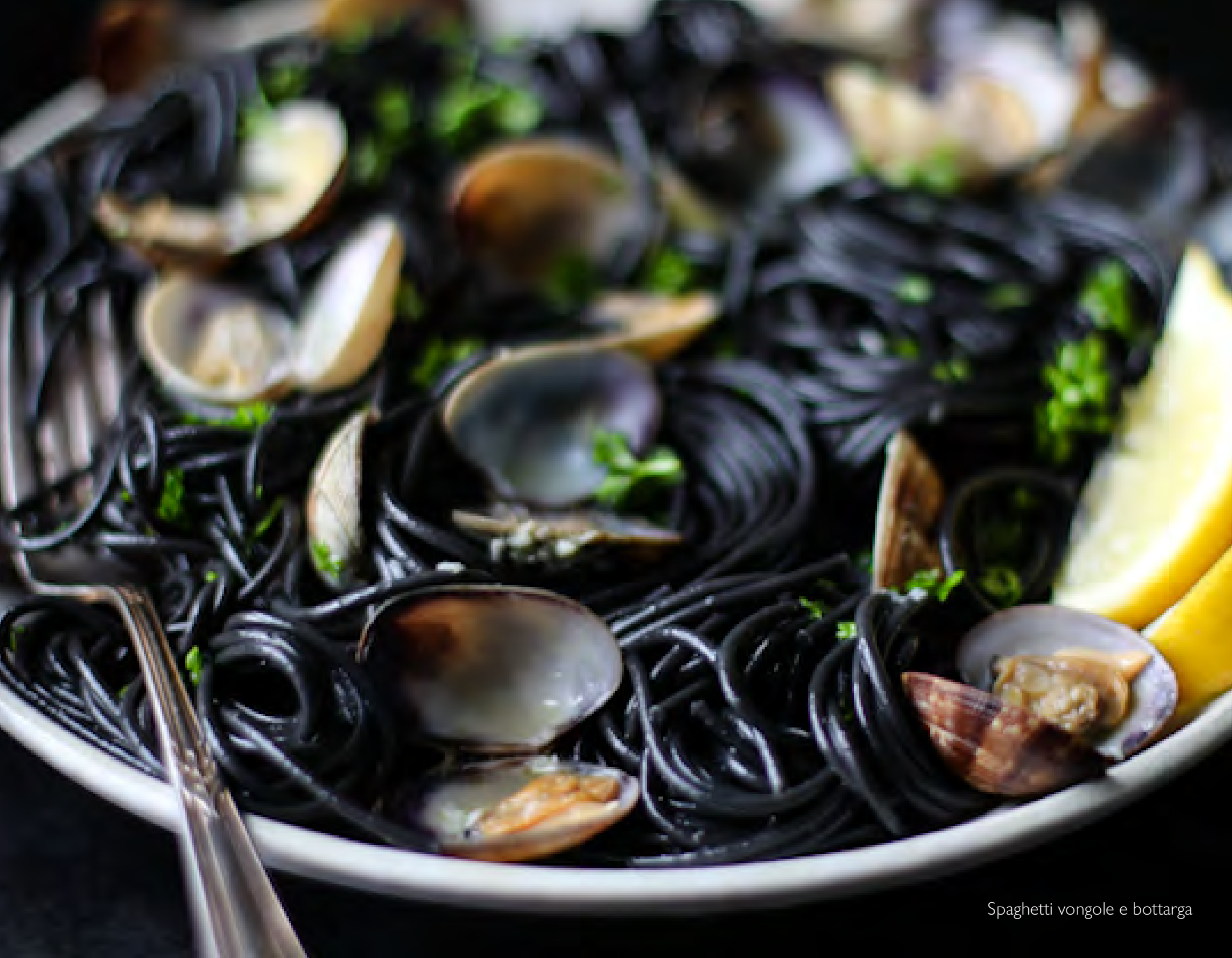
Spaghetti vongole e bottarga