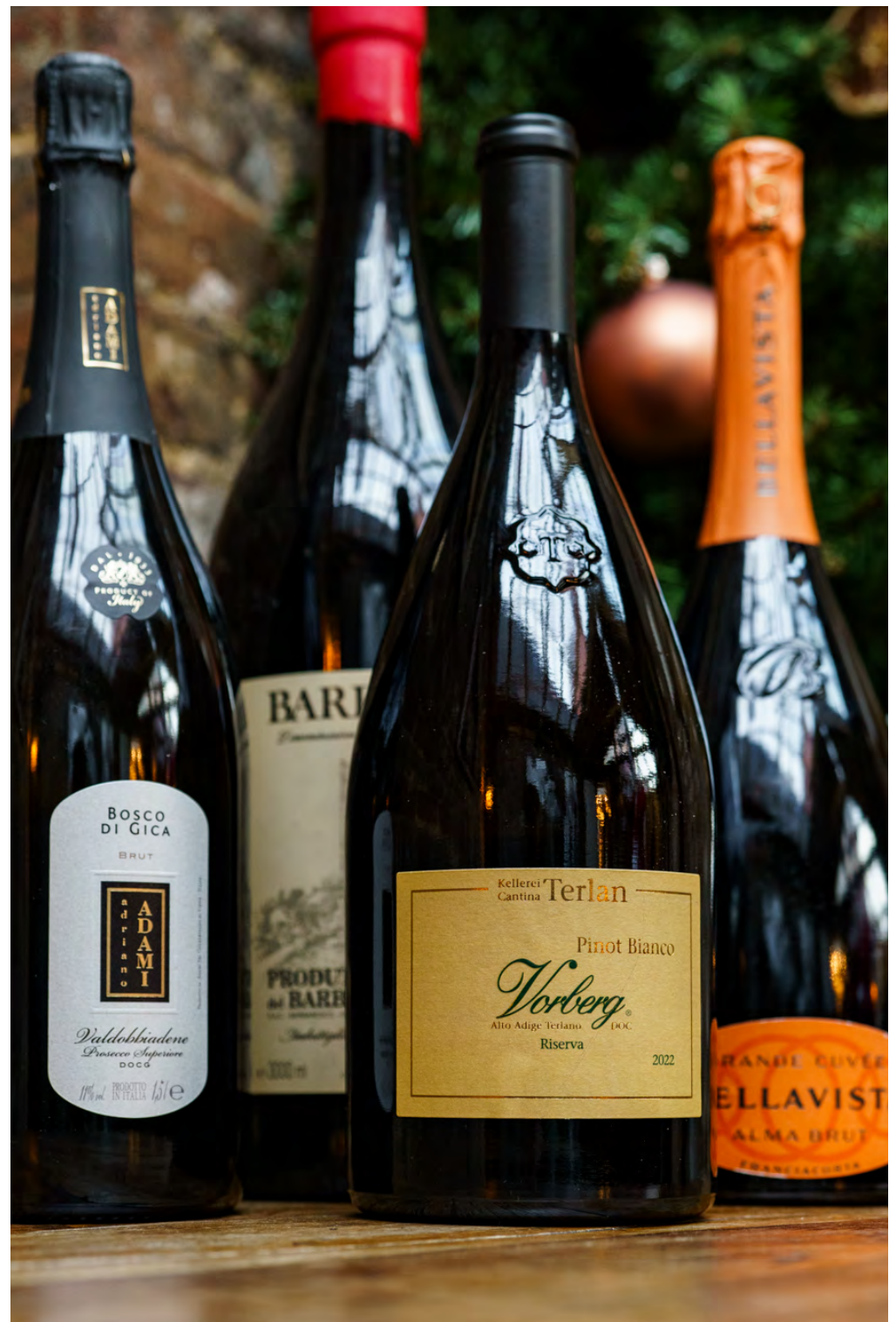
Italian Wine Cellar