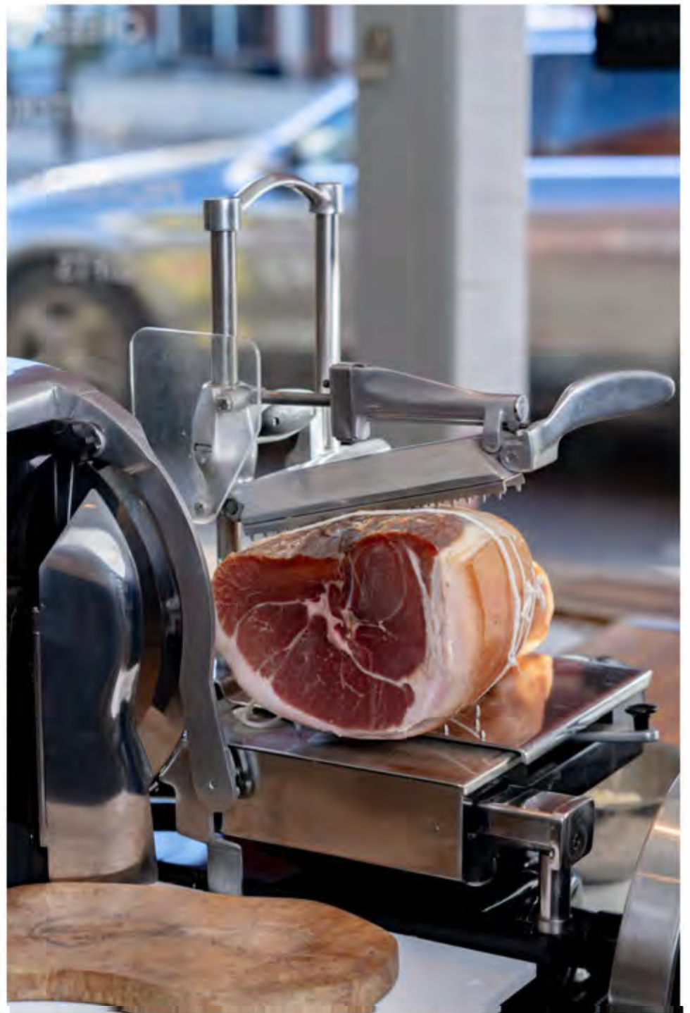
Hand sliced prosciutto in front of your guests