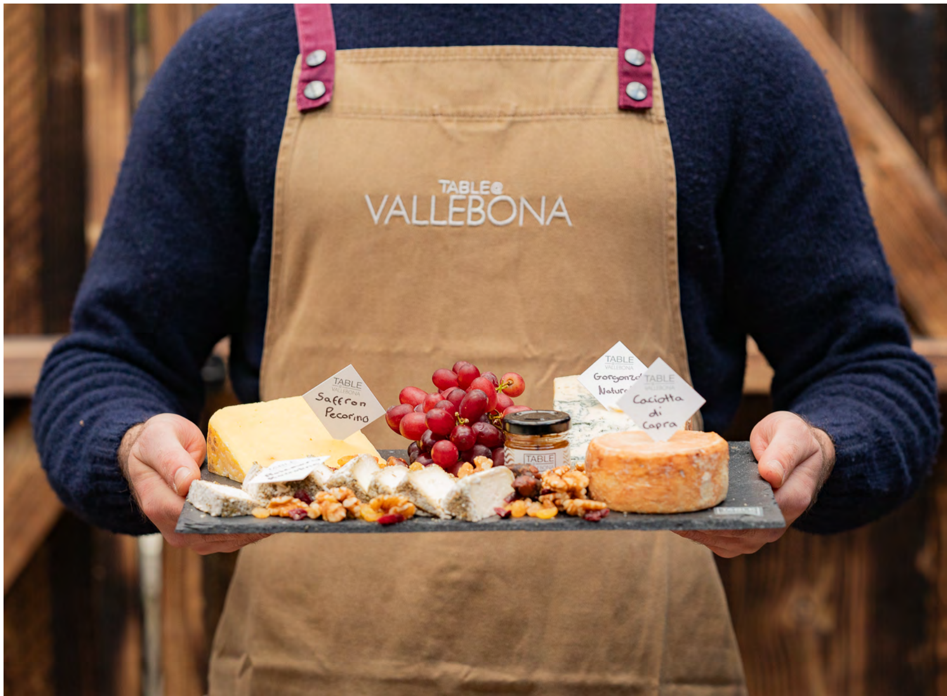
Artisan Cheese Slates