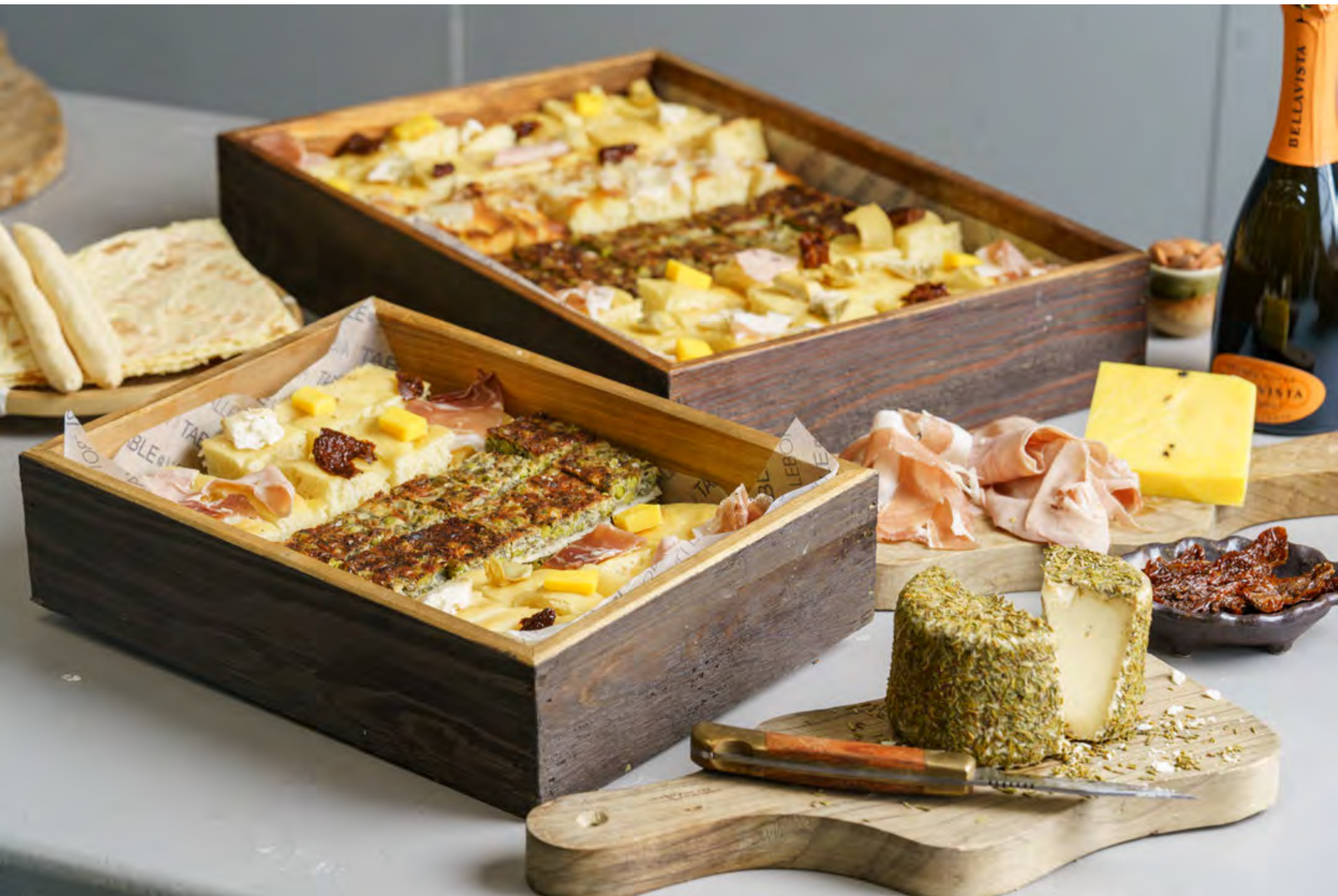
Grazing tables with artisan Italian produce